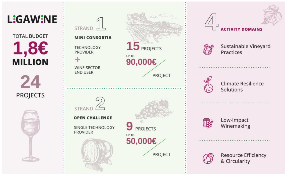
Figure 1 Overview of the LIGAWINE Open Call scheme

The LIGAWINE Open Call will provide Financial Support to Third Parties (FSTP) to selected sub-projects that support the deployment, validation, and market uptake of low-input, sustainable, and digitally enabled solutions for viticulture and winemaking. Figure 1 provides an overview of the Open Call scheme.