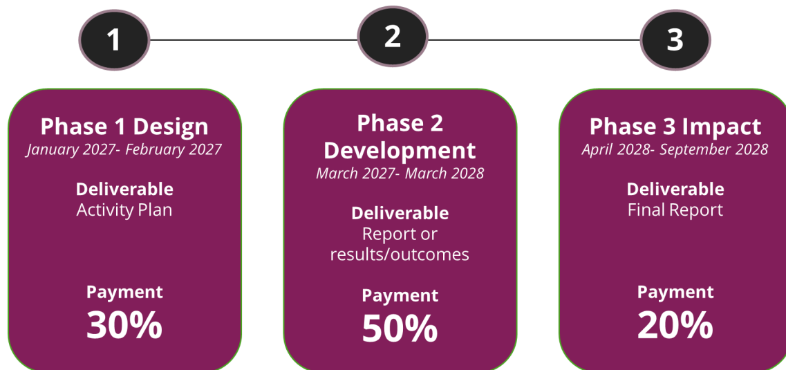
Figure 4 LIGAWINE Open Call Implementation Phases

Selected sub-projects are expected to run from January 2027 to September 2028 and payments will be made only after the relevant deliverable has been accepted. The phases are presented in Figure 4.